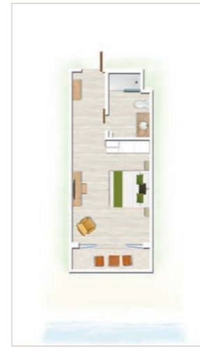
Standard Room / Standard Beachfront