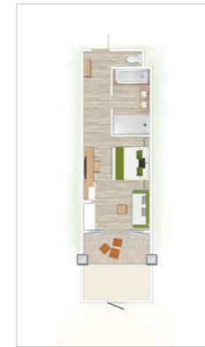
Superior Room / Superior Beachfront